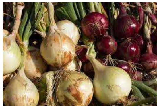
ALLIUM CEPA PLANT

was seen in diabetic patients when given a single dose of 50gm of onion juice.