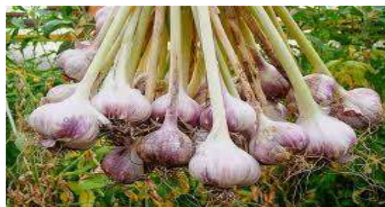
ALLIUM SATIVUM PLANT

It is cultivated all over India and is a perennial herb. This contain allicin which is a sulfur containing compound and is responsible for its pungent odour and is shown to have hypoglycemic activity. It increases hepatic metabolism, increased insulin release from pancreatic beta cells. The aqueous homogenate of garlic which is 10 ml per kg per day when administered orally to sucrose fed rabbit 10 g/kg /day in water for two months increases the hepatic glycogen and free amino acid content, decreased fasting blood glucose and triglyceride levels in serum as compared to sucrose control.