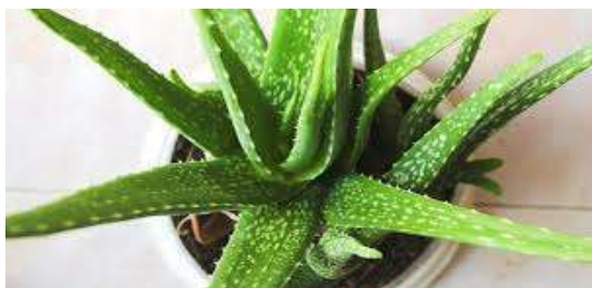
HERBAL PLANT ALOE VERA

tolerance. Both the doses chronic and as well as single dose of the bitter principle of the same plant has hypoglycemic effect in diabetic rats. The effective action is been due to the stimulation and release of insulin from pancreatic beta cells. The plant is also supposed to have an anti-inflammatory which is dependent upon dose and improves wound healing in mice 9 .