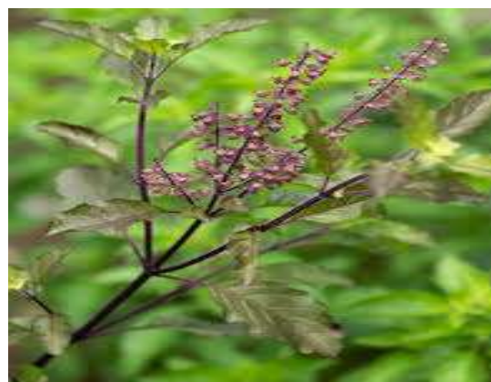
HERBAL PLANT TULSI

Commonly it is known as Tulsi. This plant is famous for its medicinal properties. Aqueous extract of plant has shown to have significant reduction in sugar level in blood in case of both normal and alloxan induced diabetic rats. The hypoglycemic and hypolipidemic effect of the plant Tulsi in diabetic rat was indicated due to significant reduction in fasting glucose uronic acid, total amino acid, total cholesterol, triglyceride and total lipid. When the plant is administered orally for 30 days(200mg/kg) it led to the decrease in plasma glucose level by 9.06% and 26.4% on 15 and 30 days respectively. A 10-fold increase in renal glycogen content and a reduction in skeletal muscle and hepatic glycogen level by 68% and 75% respectively were seen in diabetic rats as compared to control.