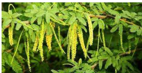
ACACIA ARABICA PLANT

Mainly it is a wild habitat found all over India and the plant extract works as secretagogue to release insulin. It is responsible for inducing hypoglycemic effects in control rats but fail to do so in alloxanized animals. Seeds when administered in powdered form into normal rabbits induces hypoglycemic effect by initiating release of insulin from pancreatic beta cells 9 .