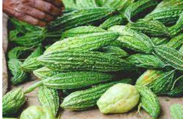
BITTER GOURD FRUIT

orally along with food. 2-3 fresh unripe fruits are taken at any time per day for three months.